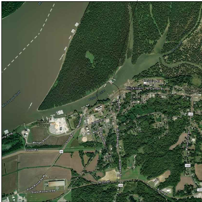
VICINITY MAP SCALE: NTS