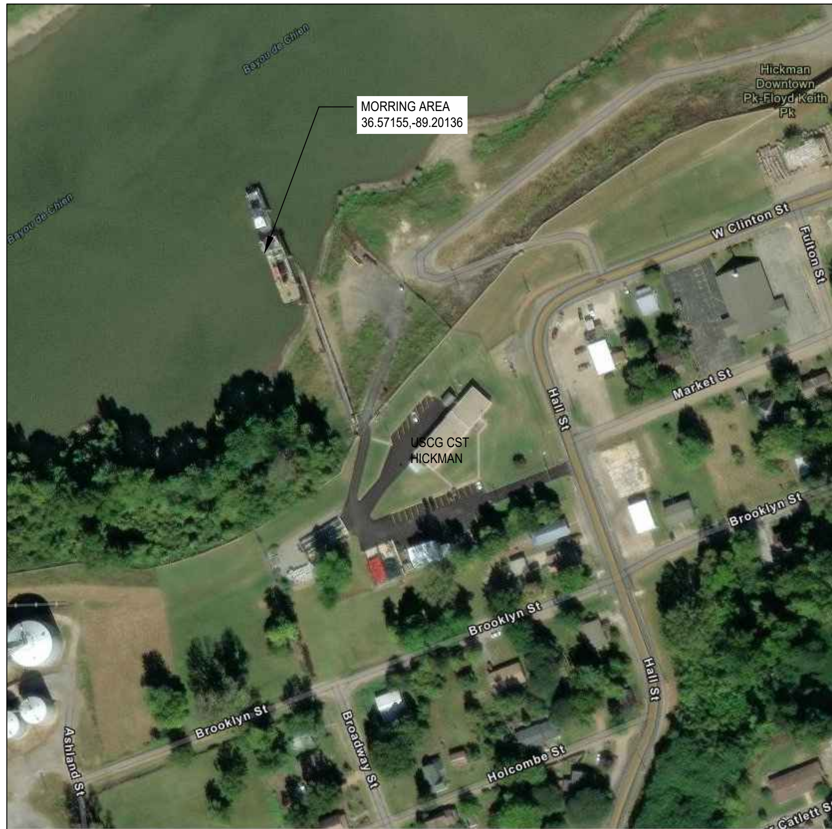
SITE MAP SCALE: NTS